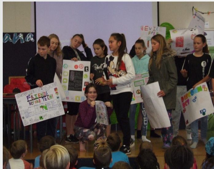
Sunflower and Moana students showing their beautiful art, and mindful persuasive messages, about wellbeing and being device free.