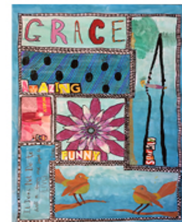
Little Picasso's Term 1 - 2015 Lesson Dates

Monday 4:30pm-5:30pm or Wednesday 4:30pm-5:30pm.